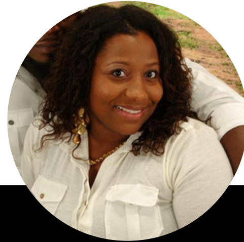
H.E.R. DIRECTOR OF OUTREACH