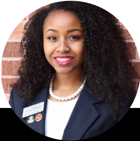
H.E.R. EXECUTIVE VICE CHAIR