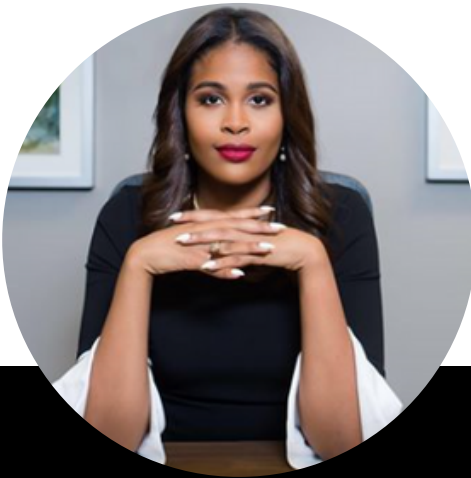
H.E.R. GENERAL COUNSEL