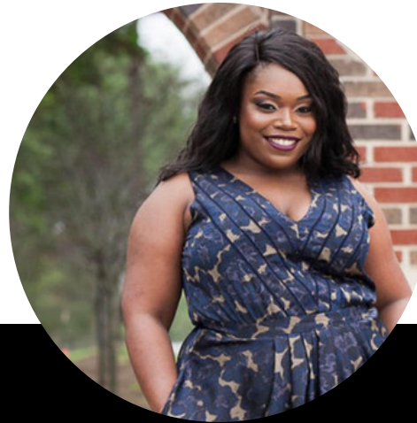
H.E.R. DIRECTOR OF SPECIAL EVENTS